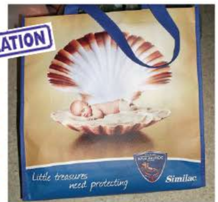
Abbott Nutrition gift bag handed out at baby fairs in Calgary, Alberta and Saskatoon, Saskatchewan. The bag shows the Similac brand name and logo with the promotional slogan 'Little Treasures Need Protecting'. Picture of the infant on the gift bag does not reflect safe sleep guidelines.