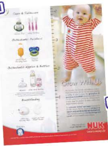
This Gerber NUK ad above says 'Grow With Us' because 'generations of mums have trusted NUK. Various products for different stages of baby's growth are featured including feeding bottles and teats.