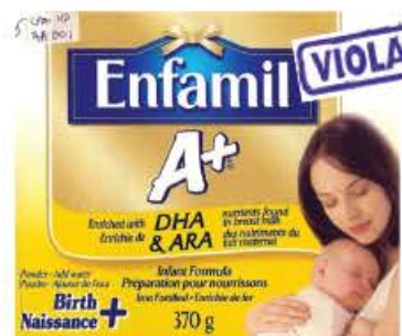
Enfamil A+ – idealising image of mom and baby on the label, with claims to boot – only in Canada and nowhere else

Claims idealise a product. Hence they are promotional by nature and prohibited by the Code. Claims are specifically banned by WHA 58.32 [2005] unless allowed by national laws.