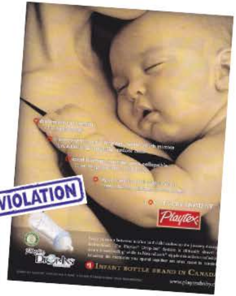
This Playtex ad promotes the image of bonding between mom and baby with the slogan, 'Love every moment'. Among other things, the ad claims that Playtex products 'mimic breastfeeding'. Most appealing of all, 'mum' purportedly 'enjoyed my first full night's sleep now that my husband can feed her.'