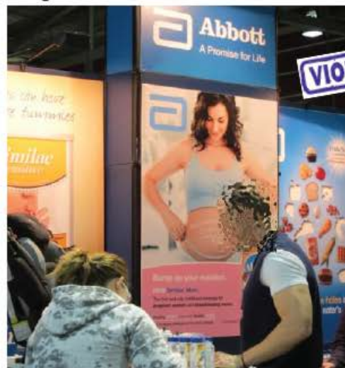
An Abbott dietitian signs up a participant for a baby club at the Calgary Alberta Baby and Tot Fair.

▲ Lansinoh's response to complaints about its mOmma Twitter Party was that it is their corporate mission to support all breastfeeding mothers and that includes talking to moms directly. So much for ethical marketing in the spirit of the WHO Code as the company claims to be doing.