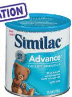
Similac Advance contains 'special nutrients found in breastmilk'