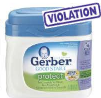
Good Start protect ... for Complete Nutrition, Easy Digestion and Advanced Immune Support